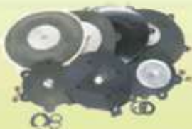
19- REPAIR EQUIPMENT