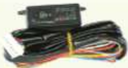
13 - SWITCH

This unit uses on the carburetion engine installation it controls to switch petrol and LPG on and off, and also it is electricly controlled selenoid valve.