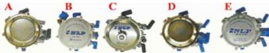
11 - CARBURATOR LPG REGULATOR