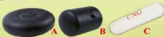
20 - LPG / CNG FUEL TANK