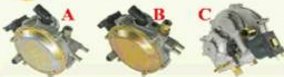
14- CNG CARBURATOR REDUCER

It installes in car cocpits, and controls the car work with gas or petrol fuel. Also show the tank LPG level.