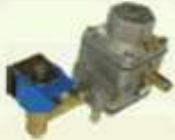
15- CNG SEQUANTIAL REDUCER

It is one of the main important unit of Autogas systems, by engine cooling water get's heat up and evaporate the gas wich is passing trough the reducer, by adjustable gas pressure it delivers the gas to engine as needed.