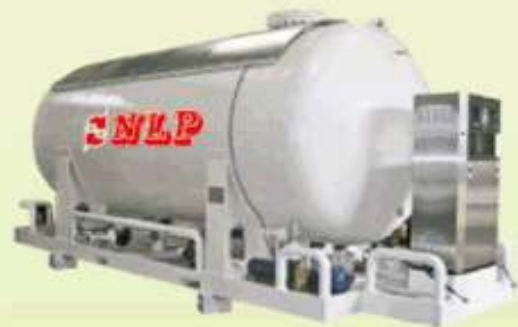
21 - LPG SKID STATION